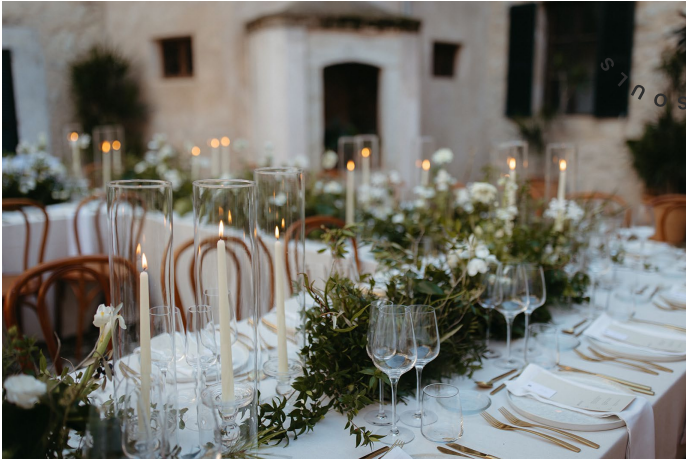
at Finca Morneta